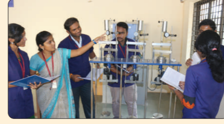
Soil Mechanics Lab