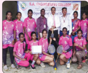
Volleyball 2nd Place (Zonal)