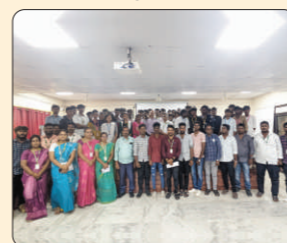
Site Engg. Workshop