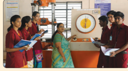
Strength of Materials Lab