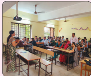
Advanced Water Treatment