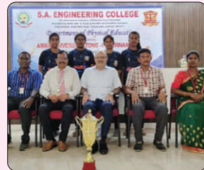
Table Tennis - Winners