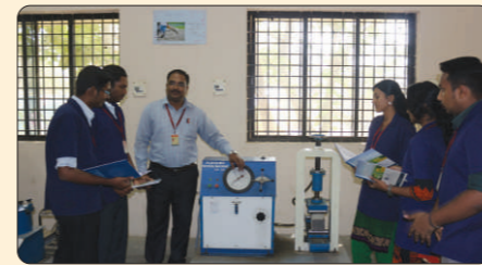
Concrete and Highway Lab