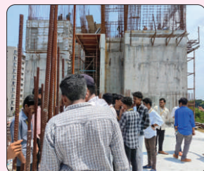
Core Wall Construction