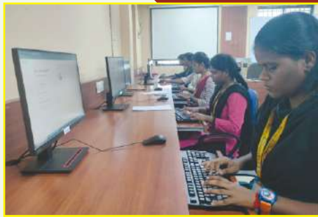
POWER SYSTEM SIMULATION LAB