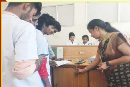
CONTROL AND INSTRUMENTATION LAB