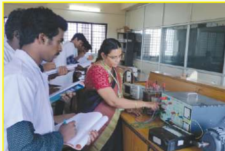
POWER ELECTRONICS AND DRIVES LAB