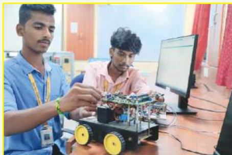
RESEARCH AND DEVELOPMENT LAB