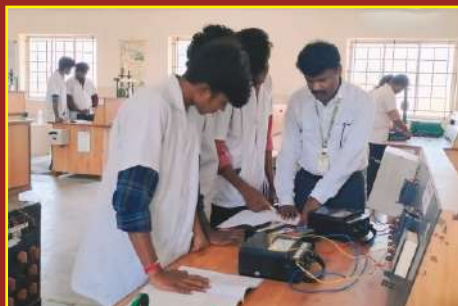
ELECTRICAL MACHINES LAB