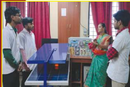
RENEWABLE ENERGY SYSTEMS LAB