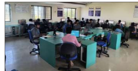
Ada Lovelace Lab