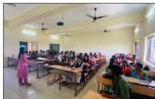
Open issue in Activity Modelling