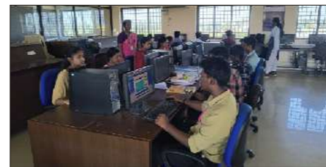
John McCarthy Lab