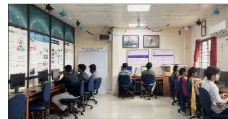
Dr. A.P.J. Abdul Kalam Research Lab