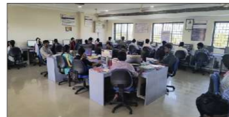
Ronald Rivest Lab